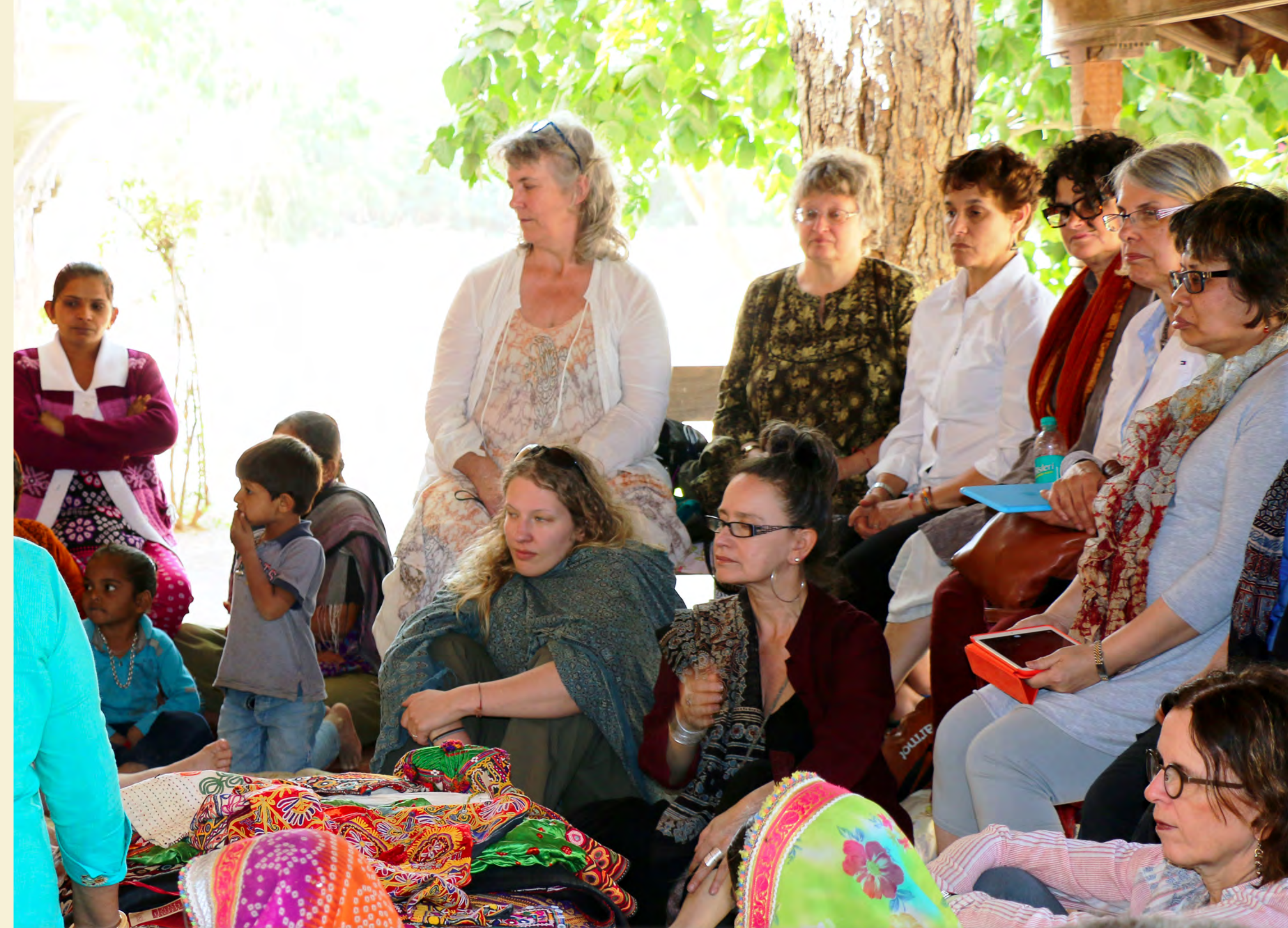
A textile group enjoying an interactive session with local artisans

In these kinds of excursions, journey experience goes beyond the typical basic tours. The objective of these unique tours is to showcase a destination in an offbeat manner distinctively aligned with a client's area of interest. We host unique and truly experiential trips celebrating several themes, such as, Textiles Tours, Culinary Tours, Battlefield Tours, Art & Architecture Tours, Women Only Tours, Photography Tours, Educational Tours, Fund Raiser Tours . Tell us where your passion lies or what you love and we will be more than happy to customize a trip according to it, giving you a priceless opportunity to live your passion. It is the best way to have a hands-on experience of things that makes you happy. Our work so far has been applauded with numerous successful journeys including The Beatles in India led by 2 times Emmy award winner Hollywood Director Paul Saltzman who was with the Beatles group during their adventure in India.