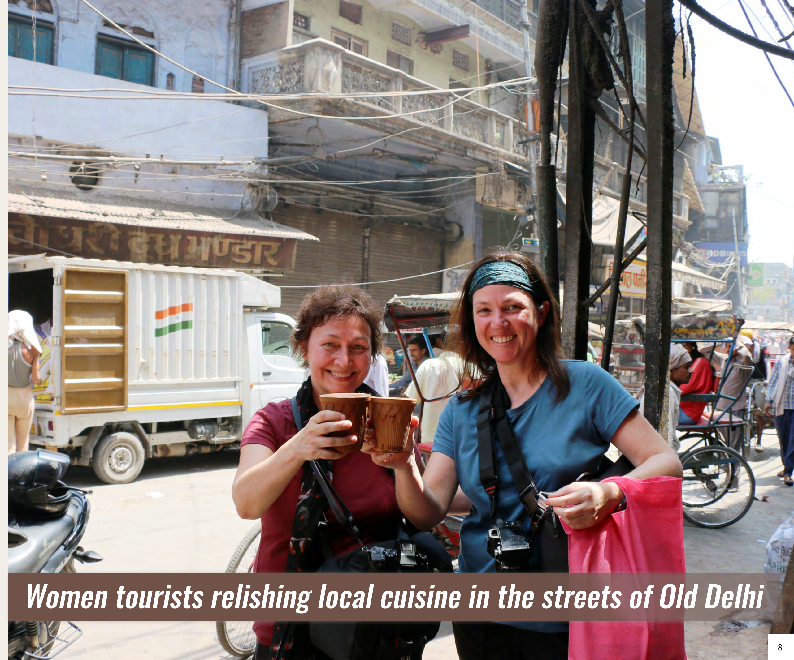
Women tourists relishing local cuisine in the streets of Old Delhi

By treading on foot, one can literally live with the locals, strike a conversation with them, listen to the folklores of elderly people, know more about their beliefs, culture, cuisines, music, street life, markets and a lot more. Feel and capture the heartbeat of real India through our guided heritage walks in the narrow lanes of Old Delhi, Mehrauli Archaeological Park & Hazrat Nizamuddin, the popular Lodhi Garden, Hauz Khas Village, informative and sumptuous culinary walks in Old Delhi, in the city of Nawabs – Lucknow etc. among many others.