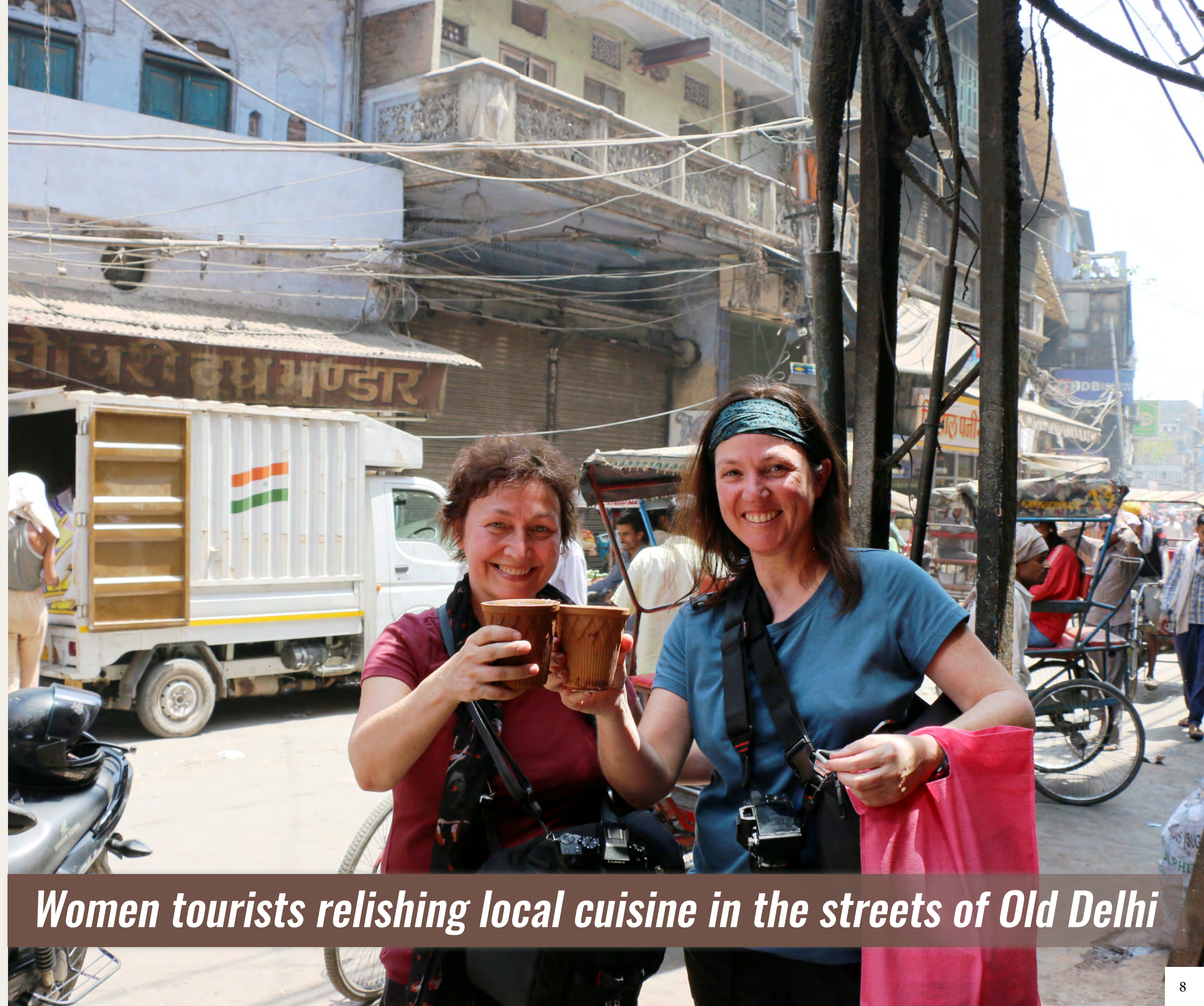
Women tourists relishing local cuisine in the streets of Old Delhi

By treading on foot, one can literally live with the locals, strike a conversation with them, listen to the folklores of elderly people, know more about their beliefs, culture, cuisines, music, street life, markets and a lot more. Feel and capture the heartbeat of real India through our guided heritage walks in the narrow lanes of Old Delhi, Mehrauli Archaeological Park & Hazrat Nizamuddin, the popular Lodhi Garden, Hauz Khas Village, informative and sumptuous culinary walks in Old Delhi, in the city of Nawabs – Lucknow etc. among many others.